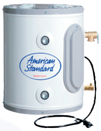
Model CE-2 1/2-AS

2 ½, 6, 12, & 20 Gallon Capacities 120, 208, or 240 V Single Phase Up to 6,000 Watts Power