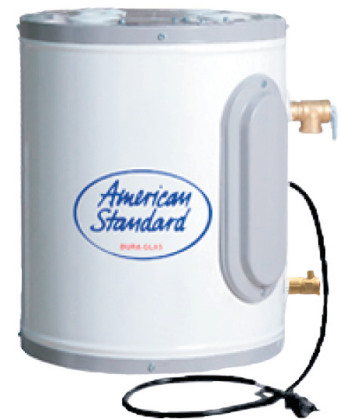
Model CE-2 ½-AS

2 ½, 6, 12, & 20 Gallon Capacities 120, 208, or 240 V Single Phase Up to 6,000 Watts Power