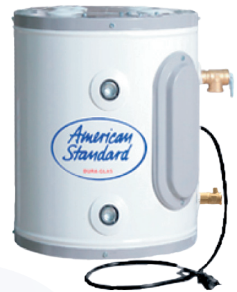
Model CE-2 ½-AS

2 ½, 6, 12, & 20 Gallon Capacities 120, 208, or 240 V Single Phase Up to 6,000 Watts Power